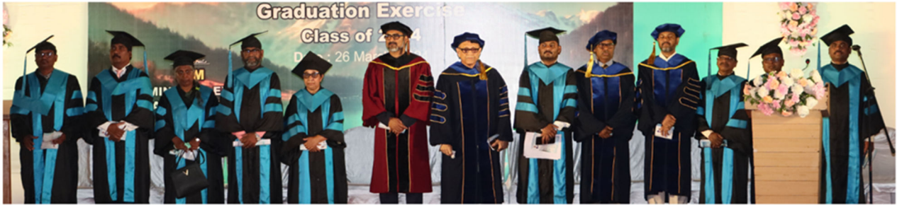
Graduation Exercise 2024