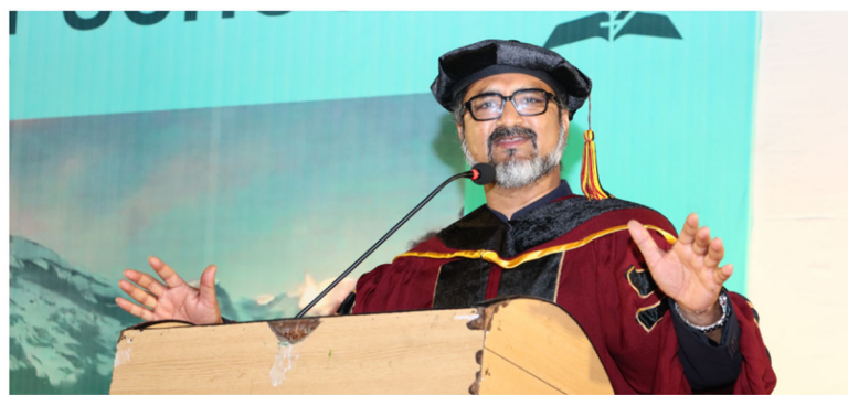
CHARGE TO THE GRADUATES BY THE PRESIDENT